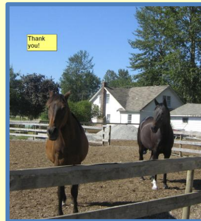
From Dancer & Jazz