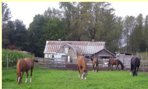
Jessie Jimmy Brock Dancer Paris September 2010