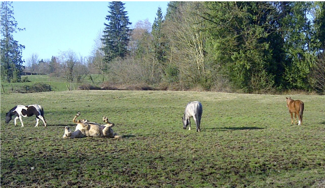
Sweetpea was accepted right away by the herd, and they all felt very comfortable with her as their newest member.