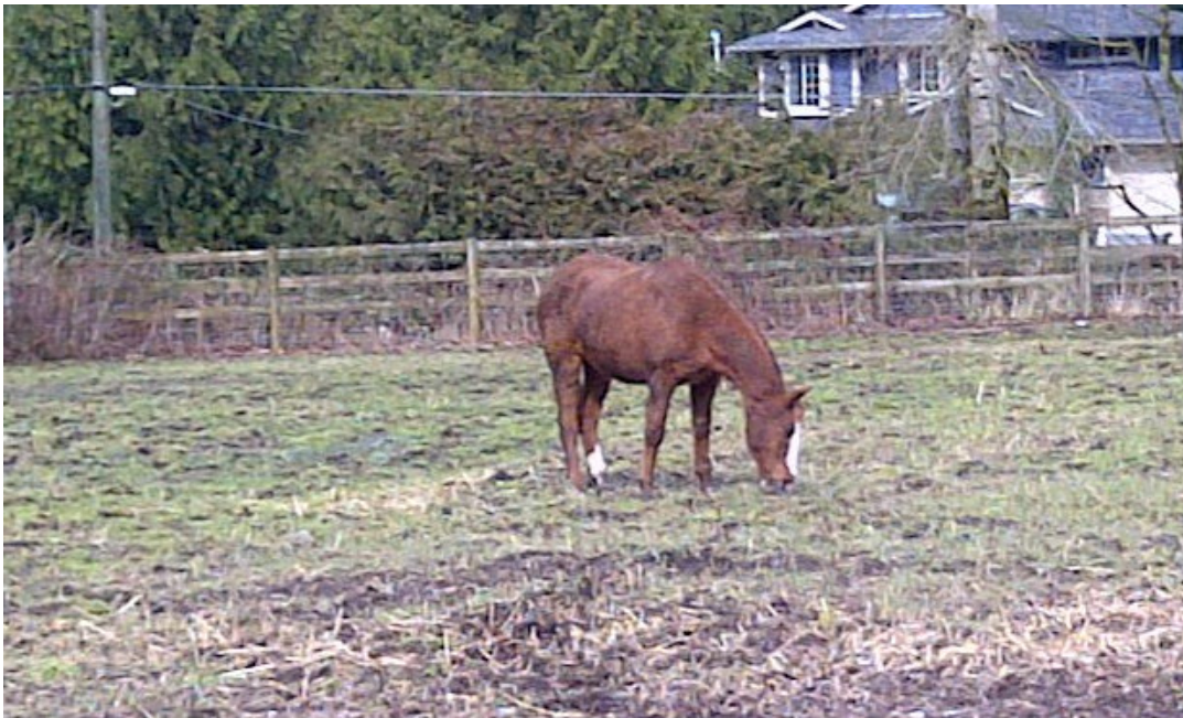
In her own field for now