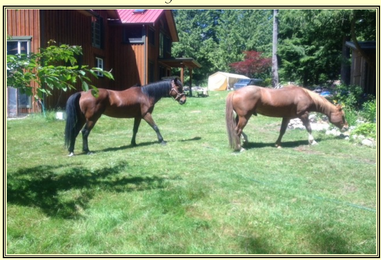
Jewel and Strider grazing at liberty

And this is so satisfying as our start together was, well, not easy! She can still get very pushy in the open sand ring with the two other horses but now allows me to move her around in that space - which is a HUGE improvement from her rearing and kicking at me in our first few experiences there! Jewel has taught me so much about myself in such a short time.