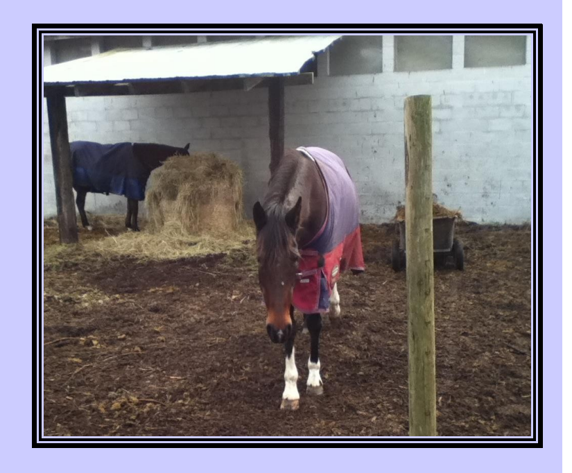
Spunky and Percy really enjoyed the summer grass, and then big beautiful round bales, all they could eat! They played and rode and did liberty stuff in the indoor and outdoor arena, and of course had many a good sprint around the track, kicking up their heels!